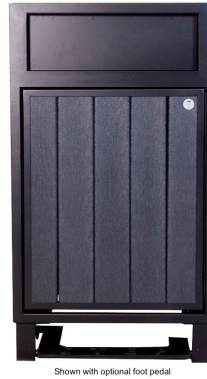
Shown with optional foot pedal