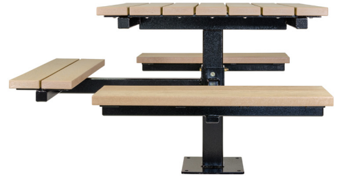
Single Pedestal Picnic Table Wheelchair Accessible One Side

The single pedestal table is one of our tried-and-true designs going back to the inception of Wishbone. All of the tables we have supplied in the last 15 years are still in use and continue to perform beyond our customers' expectations. This is in part due to the heavy-duty steel frame, and low-maintenance recycled plastic lumber. To ensure the tables lifespans are lengthened even further, we are now sandblasting and applying a Zinc Primer coat to the steel frames prior to powder coating ensuring maximum rust resistance. This table continues to be popular year after year for many reasons. The single pedestal picnic table has a significantly smaller footprint compared to a standard picnic table, works great as a game table where everyone is engaged and comes with a few options such as direct burial or surface mount. It can be wheelchair accessible by omitting one of the seats